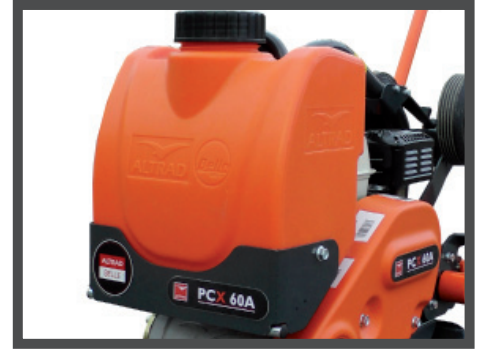
OPTIONAL 'EASY-FIT' 12LTR WATER TANK