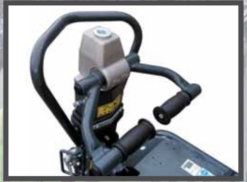
FIXED HANDLE TO AID MANOUVERABILITY