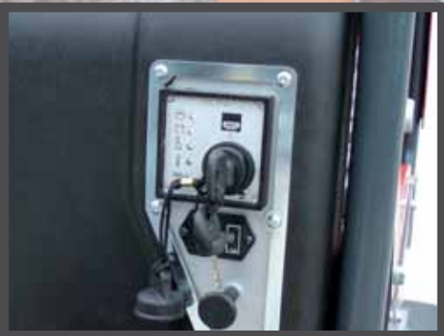
ELECTRIC, KEY IGNITION START & LED WARNING LAMPS (DIESEL ELECTRIC MODEL)