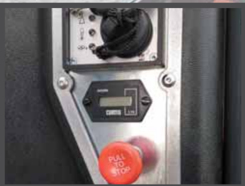
HOURMETER AS STANDARD ON PETROL & DIESEL ELECTRIC MODELS