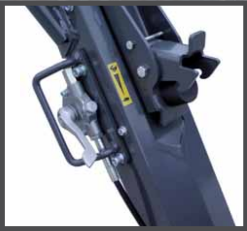
HANDLE MOUNTED THROTTLE, PERFECT FOR THE OPERATOR