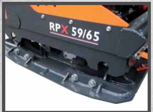
2 X 75MM OR 2 X 125MM BASEPLATE EXTENSION PLATES AVAILABLE AS AN OPTION