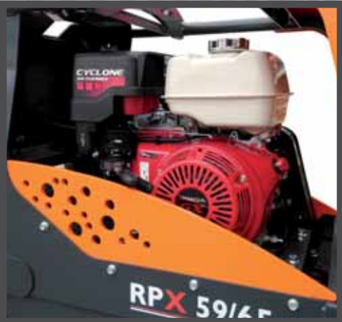
HONDA GX390 (CYCLONE) PETROL ENGINE MODEL AVAILABLE